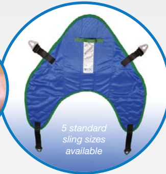
5 standard sling sizes available