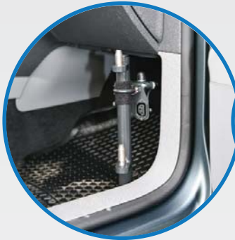
Mounting post in car, lift removed