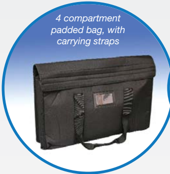
4 compartment padded bag, with carrying straps