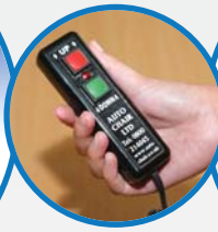
Simple hand control