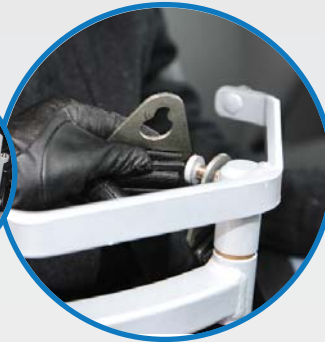
Easy to attach fixings